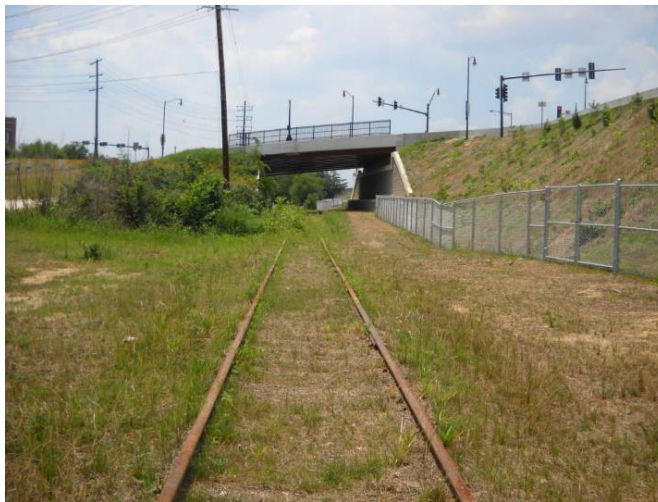
State of Project Corridor